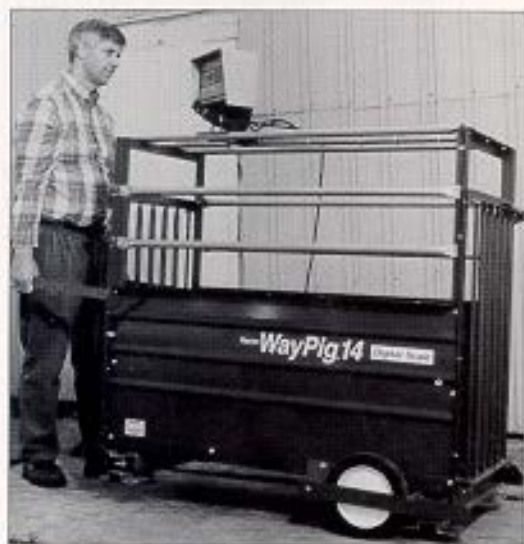
Optional wheel/handle kit makes the scale easy to move. Photo on right shows wheels locked and handles folded.