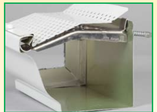
Hangers with pre-installed screws