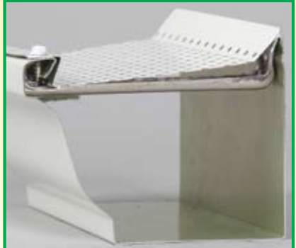
Hangers without pre-installed screws