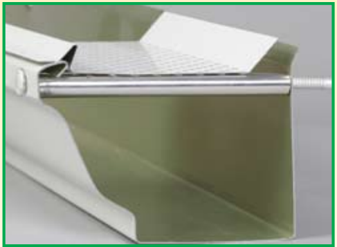
Spike and Ferrule