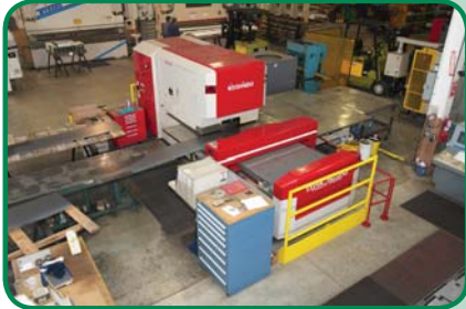
Nisshinbo 22T Hydraulic CNC Turret Punch