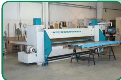
Fasti CNC Folding Machine