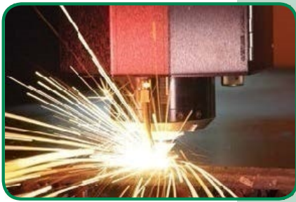
Cincinnati CL940 6' x 12' 4000 watt Fiber Laser