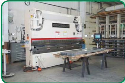
Cincinnati Autoform+ 6 axis Press Brake 135T x 12'