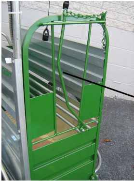
Optional Head Lock