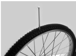
Optional Solid Tire (no flats)