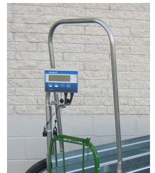
Swivel Indicator for easy viewing