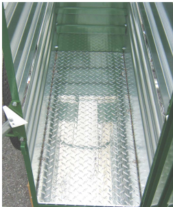
Optional Aluminum Tread Plate Floor